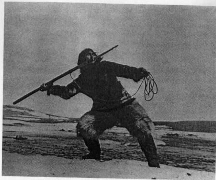
26. Still from Nanook of the North (1922), dir. Robert Flaherty.

The cinema of Flaherty worked in the same way: Nanook and his family were represented in a cinematic "ethnographic present" in which intertitles establish the camera, and thus the filmmaker, as observer. Furthermore, if the indigenous man, Nanook , is constructed as a being without artifice, as referent, the indigenous woman is there to be uncovered, her body—and this is true of ethnographic cinema in general—to be scopically possessed by the camera/filmmaker and the audience as well. As intended, however, this form of ethnographic film, infused with the notion of death and the idea of vanishing races, is a cinema of archetypal moments endlessly repeated. 14 In