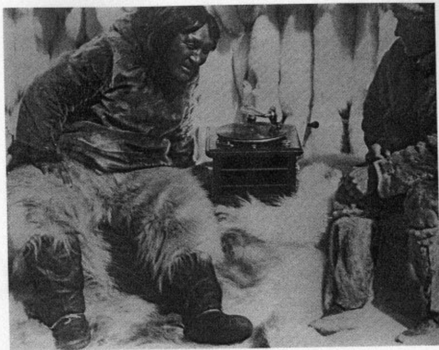
28. Still from Nanook of the North (1922), dir. Robert Flaherty.

Like a museum display in which sculpted models of family groups perform "traditional activities," Nanook's family adopts a variety of poses for the camera. These scenes of the picturesque always represent a particular view of family or community, usually with the father as hunter and the mother as nurturer, paralleling Western views of the nuclear family.