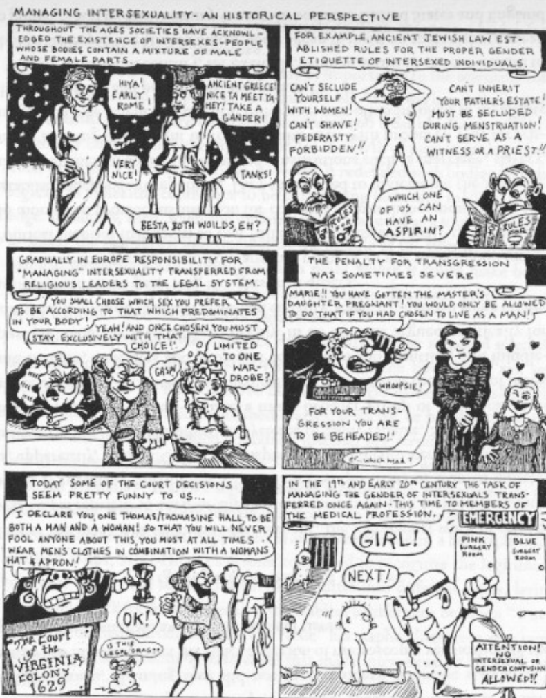
FIGURE 2.3: A cartoon history of intersexuality. (Source: Diane DiMassa, for the author)

But patients, troubling and troublesome patients, continued to place themselves squarely in the path of such oversimplification. Even during the Age of Gonads, medical men sometimes based their assessment of sexual identity on the overall shape of the body and the inclination of the patient—the gonads be damned. In 1915, the British physician William Blair Bell publicly suggested that sometimes the body was too mixed up to let the gonads alone dictate treatment. The new technologies of anesthesia and asepsis made it possible for small tissue samples (biopsies) to be taken from the gonads of