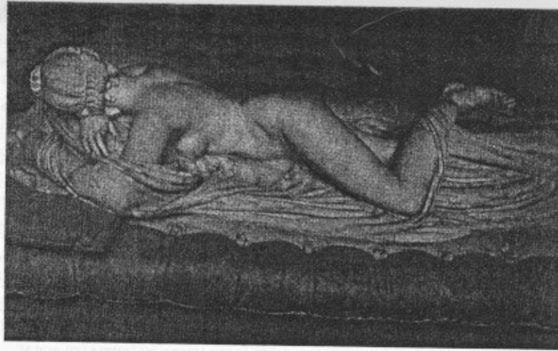
FIGURE 2.1: Sleeping hermaphrodite, Roman second century B.C.

73 tities, and how successful have their challenges been? What follows is a most literal tale of social construction—the story of the emergence of strict surgical enforcement of a two-party system of sex and the possibility, as we move into the twenty-first century, of the evolution of a multiparty arrangement.