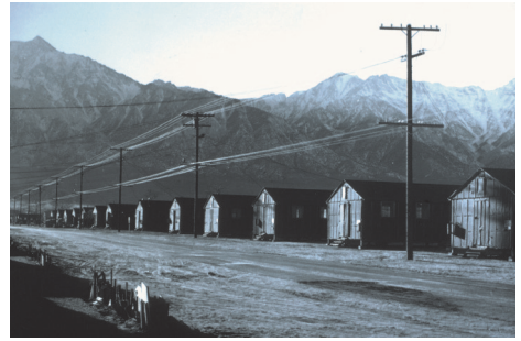
Miyatake's photo of Manzanar

Commissioner: Community Redevelopment Agency, City of Los Angeles Public Arts Task Force of Little Tokyo Community Development Advisory Committee Project Budget: $23,600